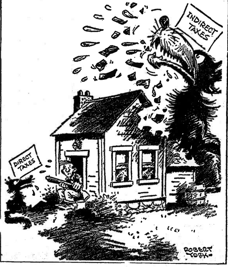
-From the Nashville (Ienn.) Banner

WHAT are a man's powers? He has physical, mental and emotional energies. All these the amoeba tries to appropriate—in Russia with considerable success.